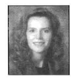
The NSC Newsletter

North Shoal Creek's #1 Agent JB Goodwin Realtors 3933 Steck 110-B 78759